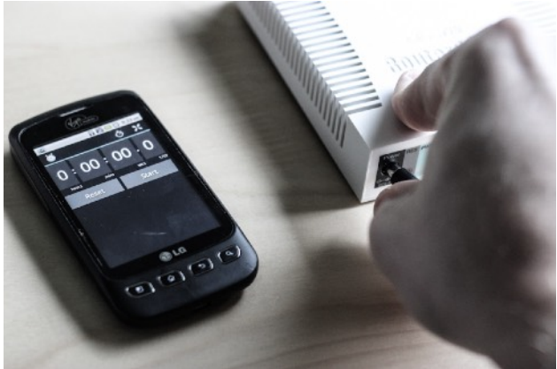
REBOOT WiFiRanger FOR 1ST TIME

UNPLUG THEN QUICKLY PLUG BACK INTO POWER TO REBOOT