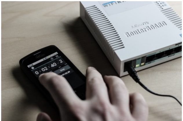
WAIT 3MIN 30SEC AFTER 3RD REBOOT