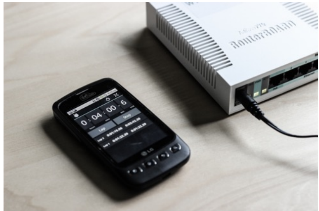
IT'S READY FOR ACTION!