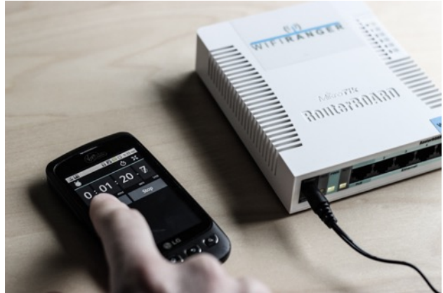
WAIT 3MIN 30SEC AFTER 2ND REBOOT